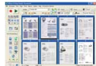
The AVScan main screen

The Avison AV3000 series scanner comes with TWAIN and ISIS drivers and are also bundled with full version of exclusive Avison AV Scan, and ScanSoft PaperPort software application.